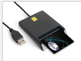
USB chip card reader